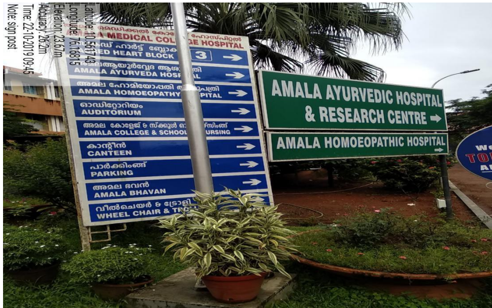
Sign post outside the college building