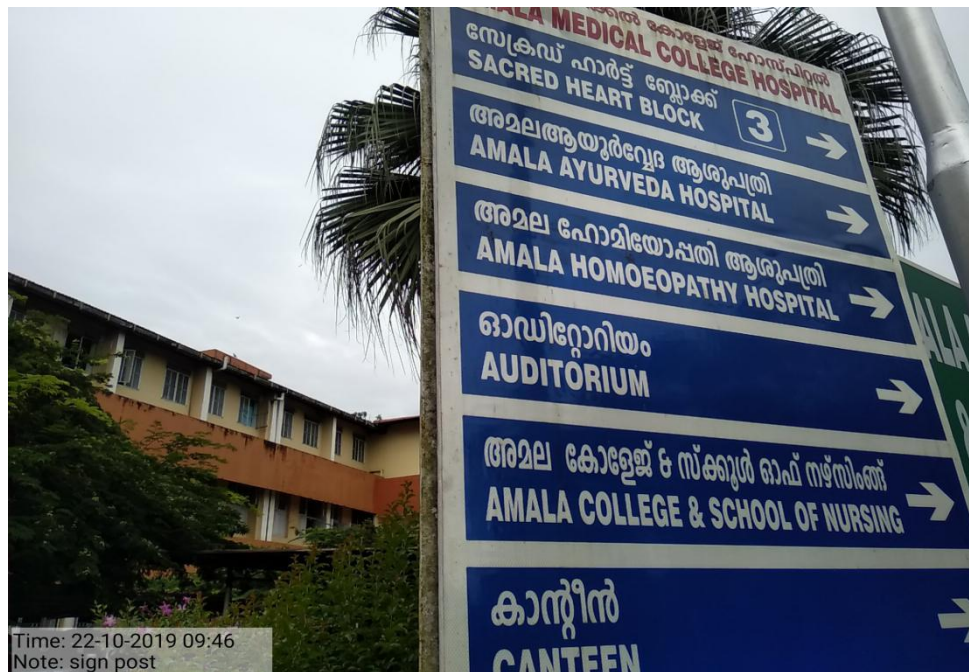
Sign post outside the college building