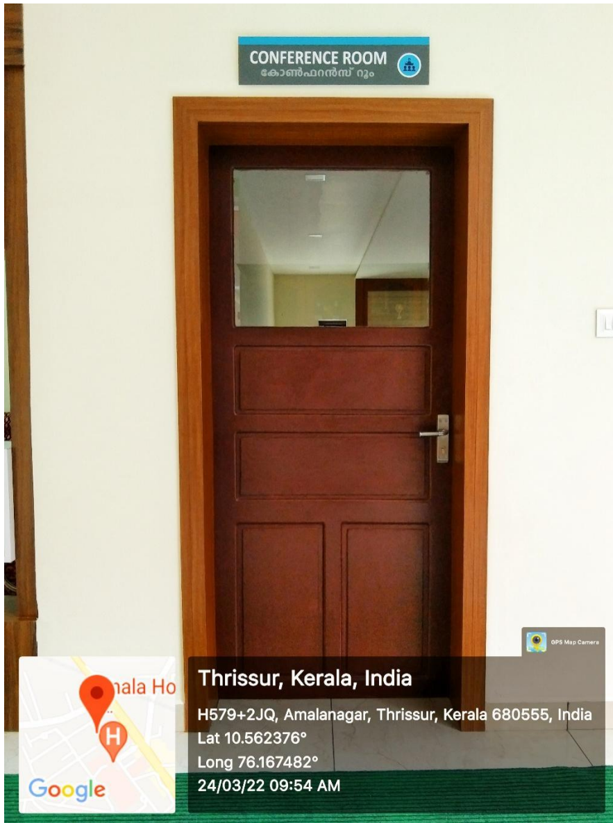
Sign post in the college showing 'conference room'