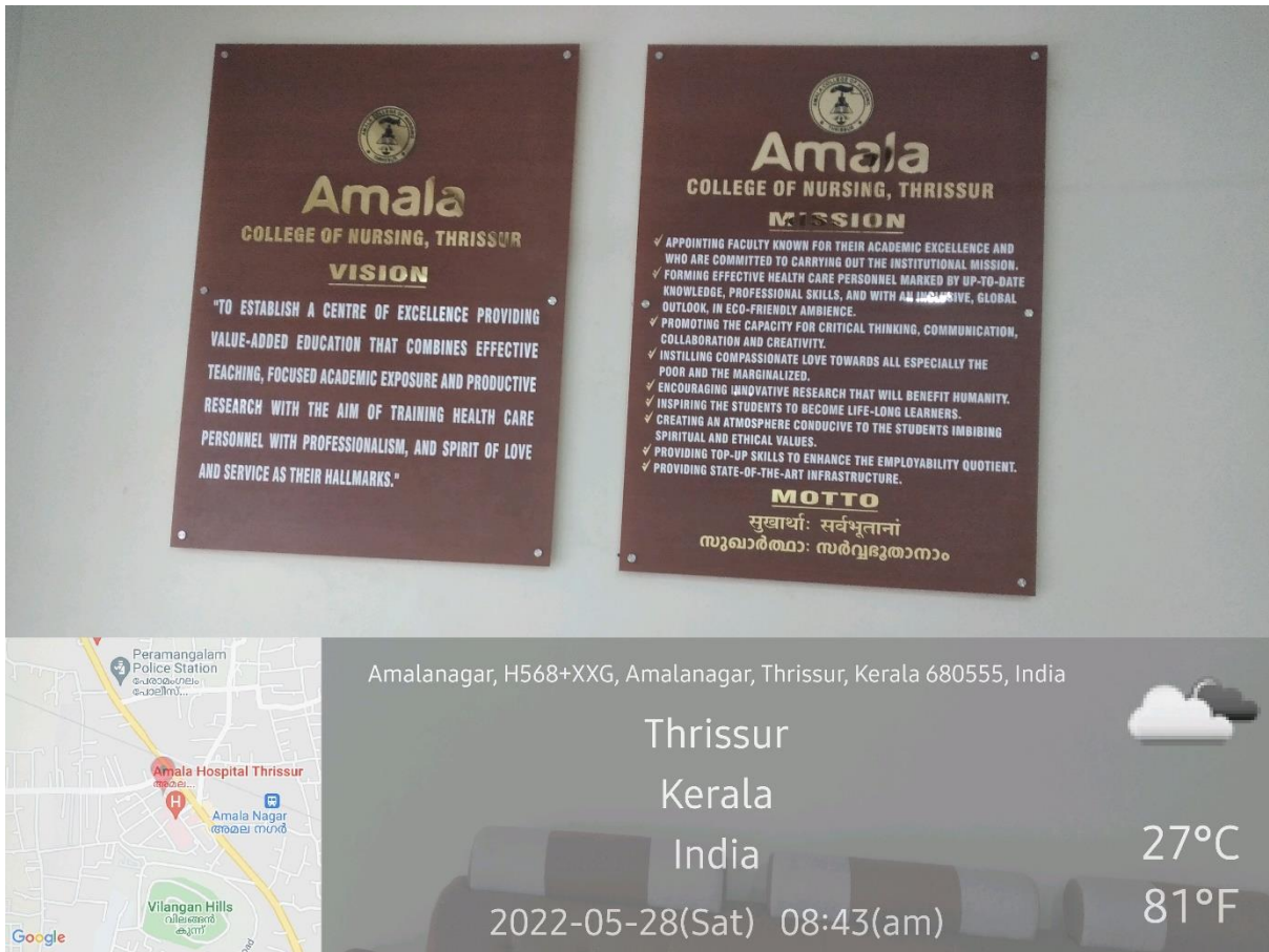
Display board in the college