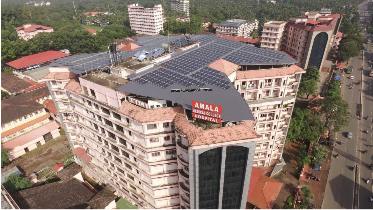
SOLAR PANEL- AMALA CAMPUS