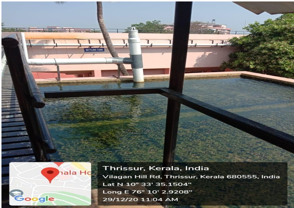
ACON, SETTLING TANK, WASTE WATER RECYCLING PLANT