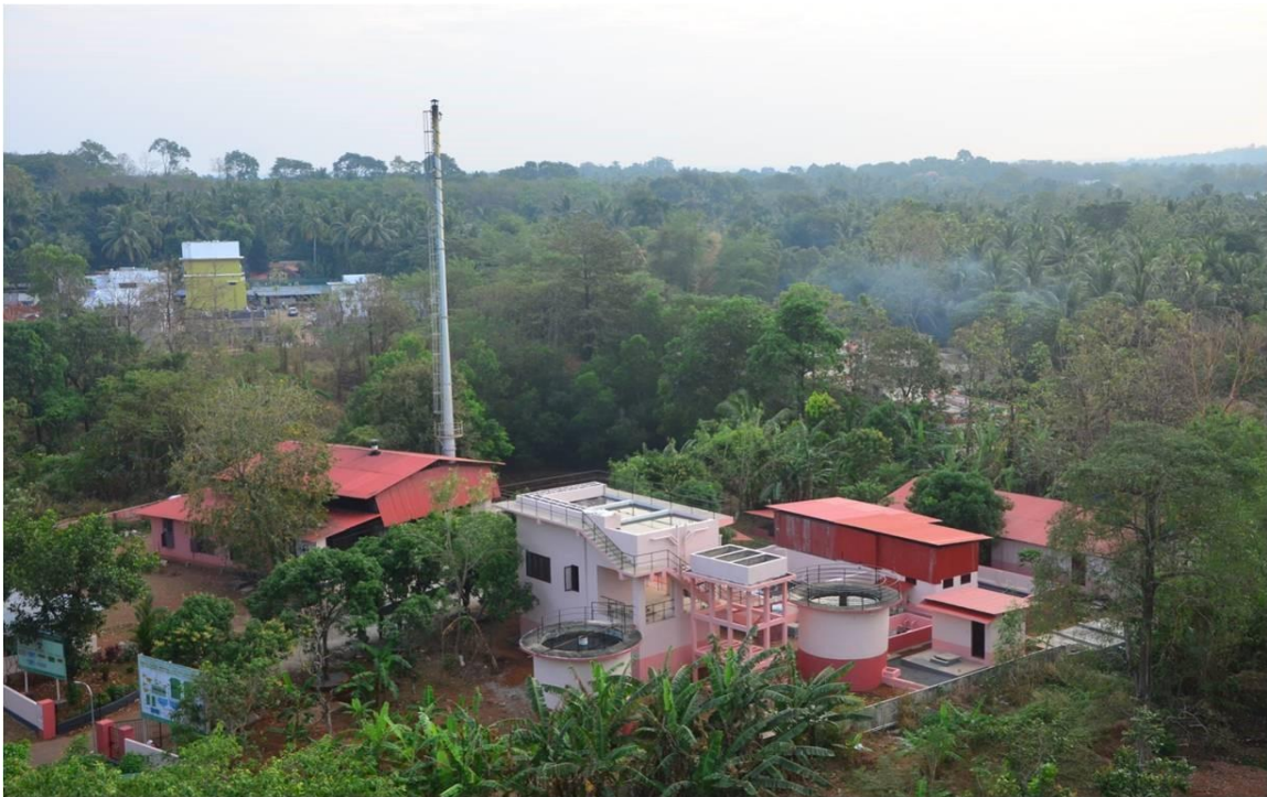
ACON, WASTE WATER TREATMENT PLANT