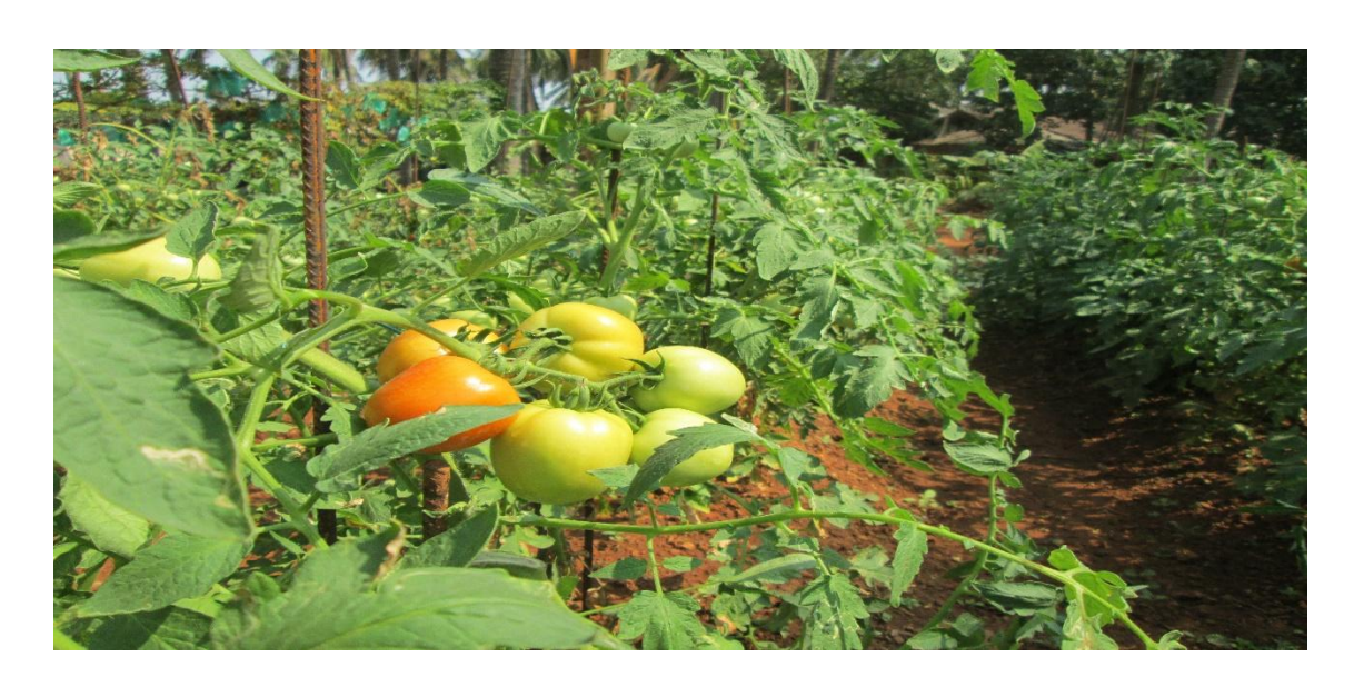
TREATED WATER USED FOR AGRICULTURE