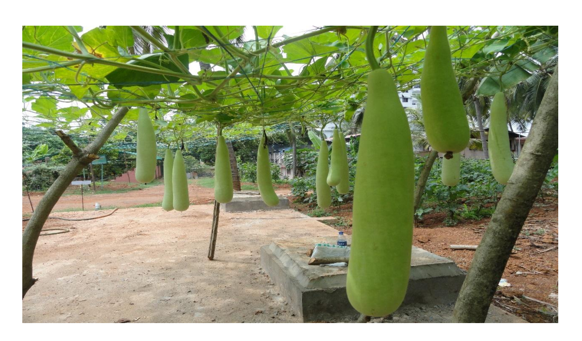
TREATED WATER USED FOR AGRICULTURE