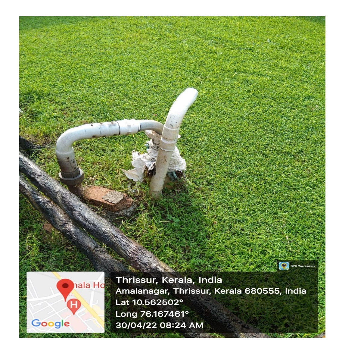
ACON, Bore well, Near to Ayurveda Hospital