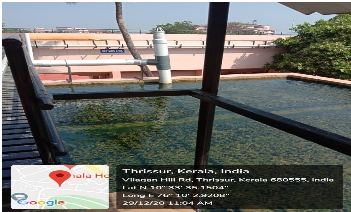
ACON, SETTLING TANK, WATER TREATMENT PLANT