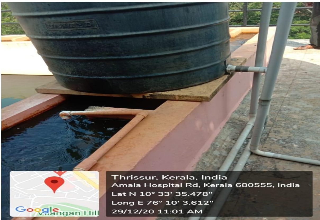
ACON, STORAGE TANK, WATER TREATMENT PLANT