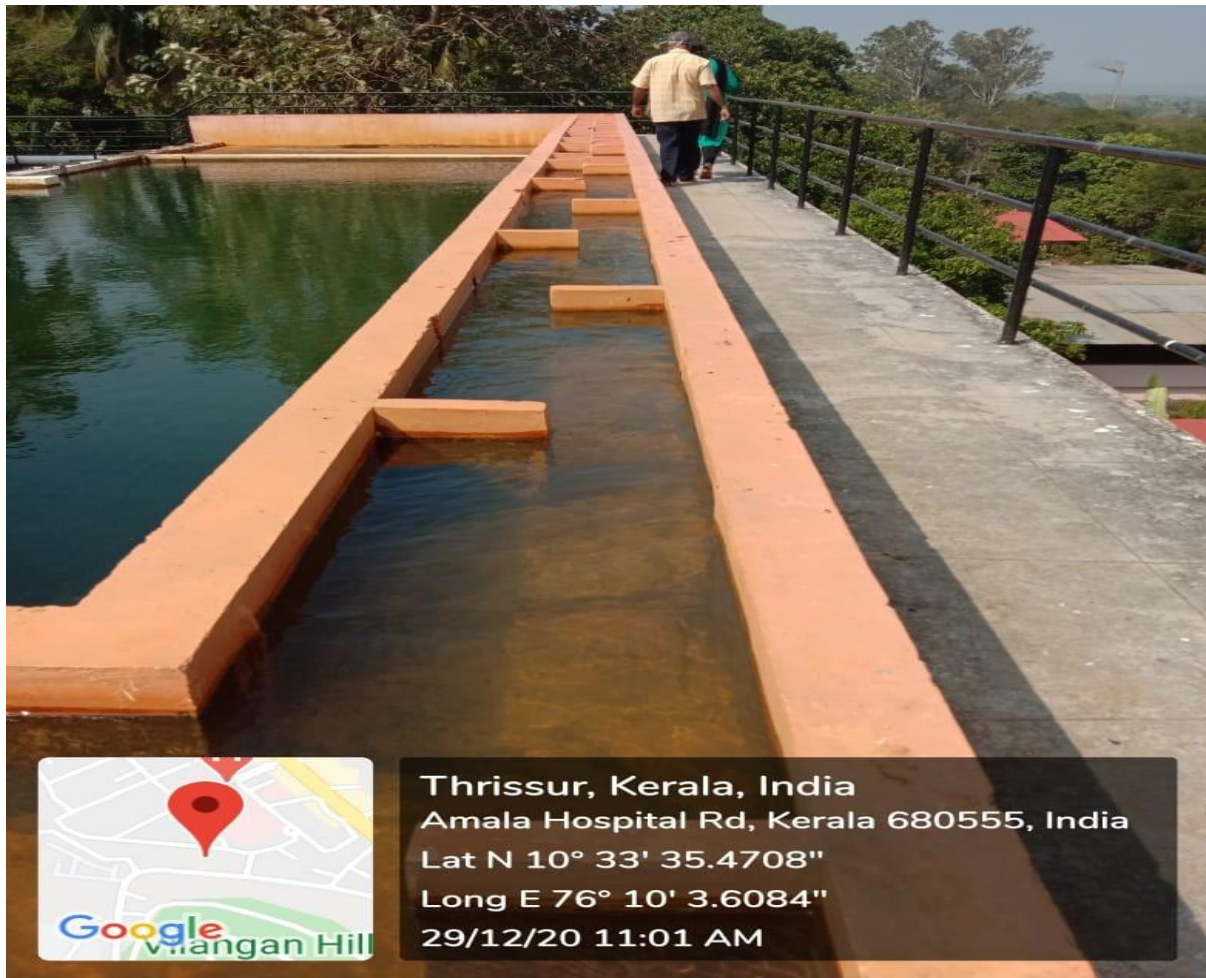
ACON, BUNDS, WATER TREATMENT PLANT