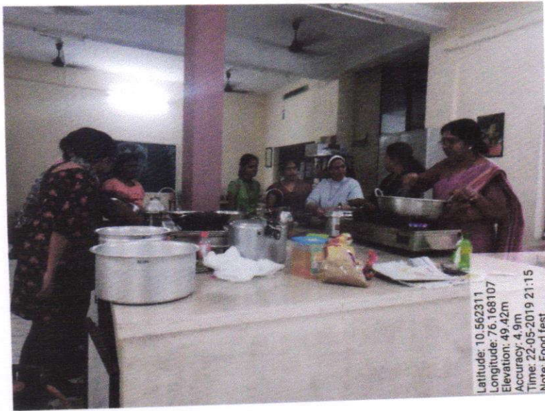
Latitude: 10.562311 Longitude: 76.168107 Elevation: 49.42m Accuracy: 4.9m Time: 22-05-2019 21:15 Note: Food fest